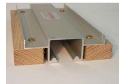
Heavy duty dual rail extruded aluminium track