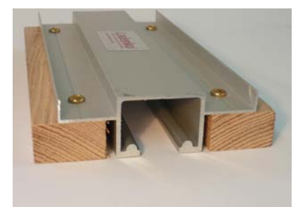
Heavy duty dual rail extruded aluminium track